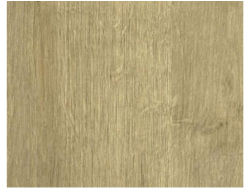
Coastal Oak CO textured