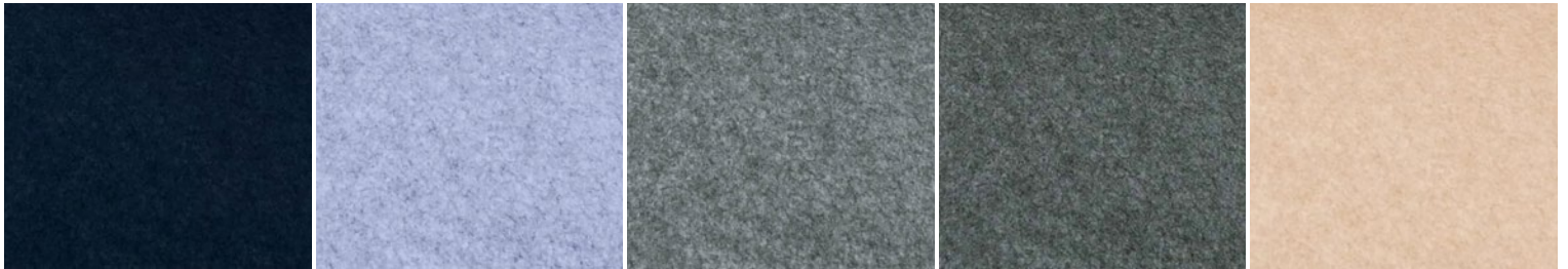
Midnight Navy MN12-D Polar Ice PI14 Elephant Gray EG11 Dark Gray DG34 Vanilla Cream VC97