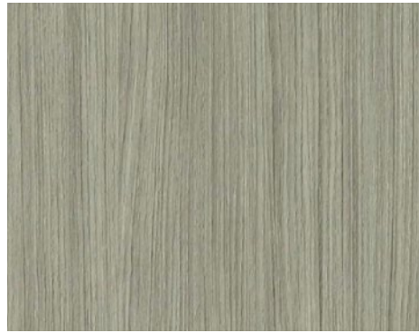
Lake Grey LG textured