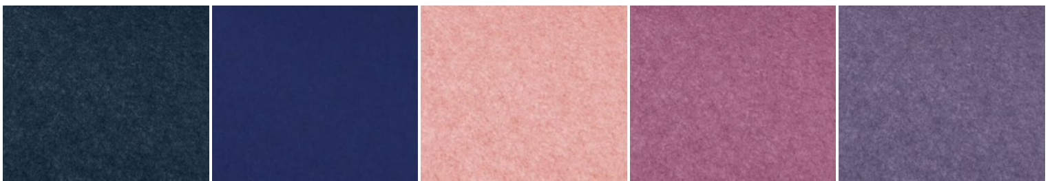
Evening Blue EB50 Royal Blue RB08 Sunset Pink SP99 Vintage Claret VC29 Soft Lavender SL30