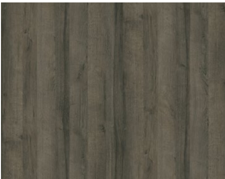
Cassis CA textured