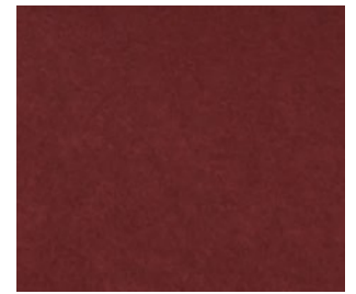
Brick Red BR34

We are pleased to offer a wide range of standard colors in our PET acoustic material. Our unique panels provide significant sound absorbency which ensures you can set any space to quiet in your smartBOX workspace.