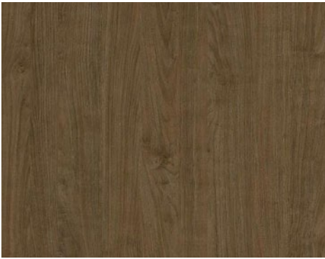
Lake Walnut LW textured