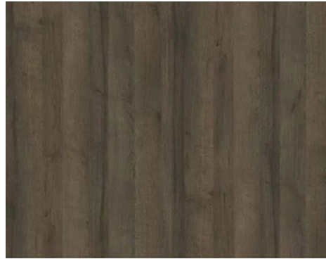
Monaco MN textured