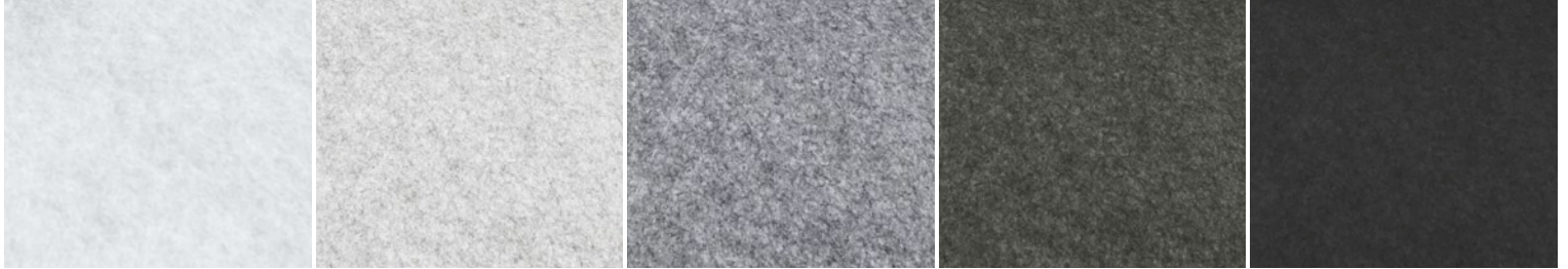
Classic White CW04-D Light Gray LG58-D Silver Gray SG04-D Charcoal Gray CG06-D Pure Black PB09-D