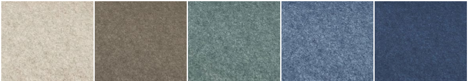
Light Beige LB01-D Camel CA60-D Eucalyptus EU22-D Steel Blue SB32-D Denim DE36-D