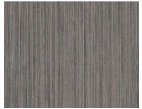
Absolute Acajou AA