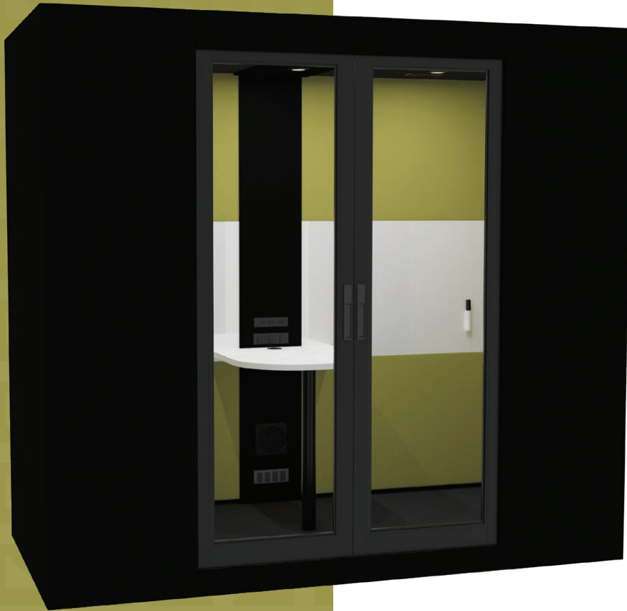
Shown in Black Laminate and Lime Felt

The smartBOX company offers an affordable solution to sound and space distractions.