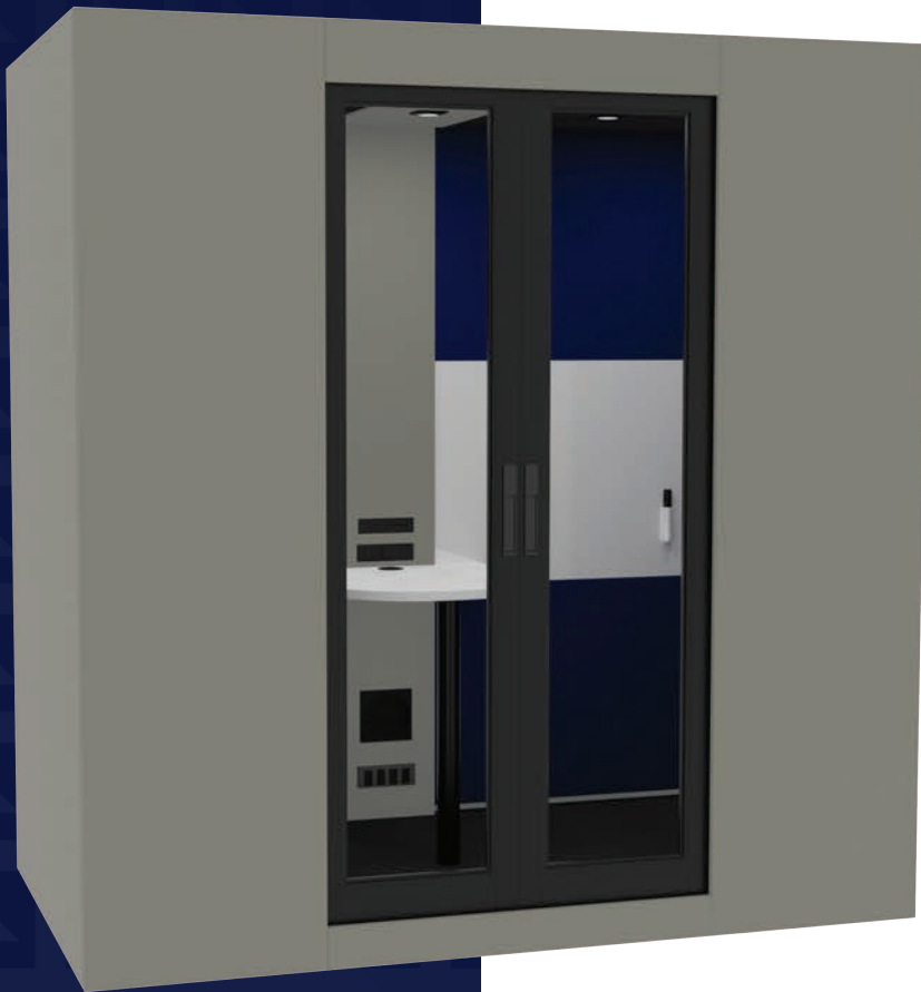
Shown in Fog Gray Laminate and Cobalt Felt

For additional information contact your local dealer or the smartBOX company: