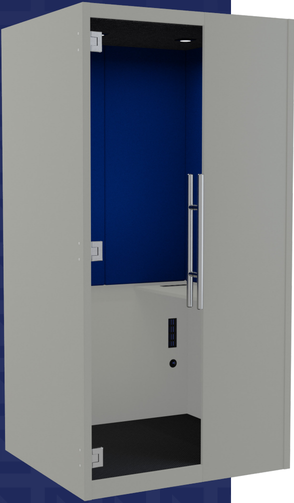
Shown in Fog Gray Laminate and Cobalt Felt

(480) 716-7925 | solutions@thesmartboxcompany.com thesmartboxcompany.com