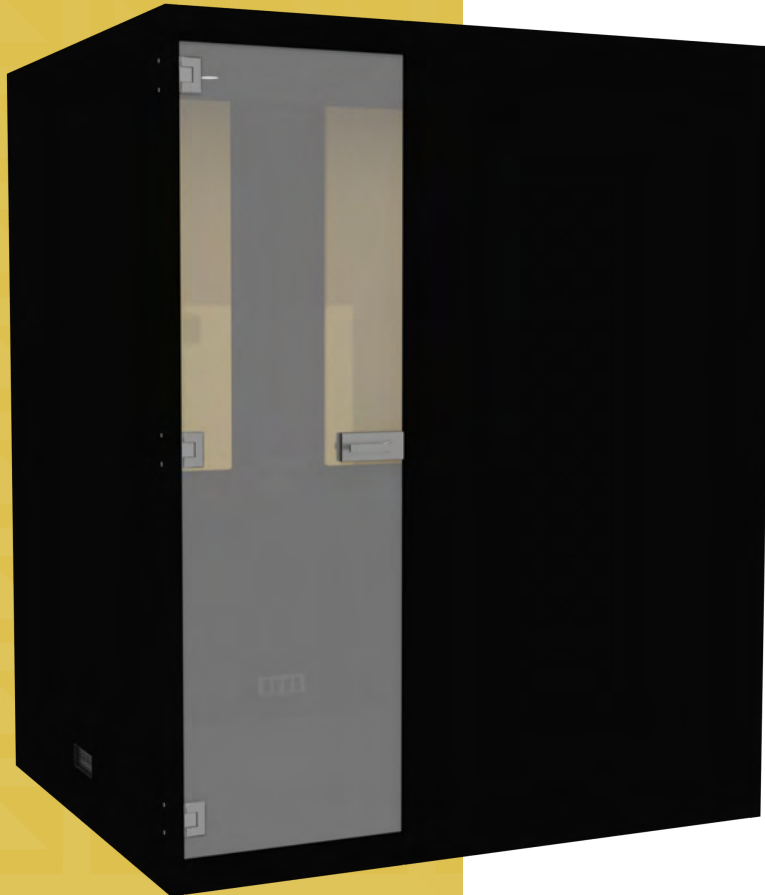
Shown in Black Laminate and Yellow Felt

For additional information contact your local dealer or the smartBOX company: